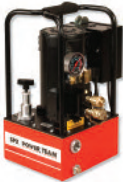
PE30TWP Torque Wrench Applications See page 171