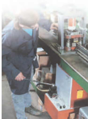
Hydraulic Machine Press Operation.