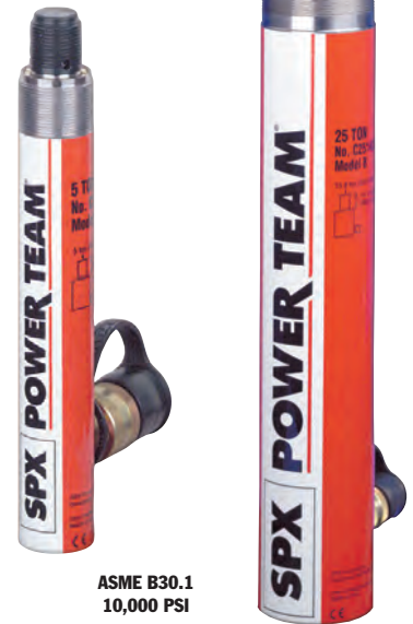
ASME B30.1 10,000 PSI