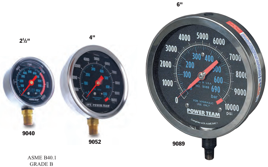
ASME B40.1 GRADE B