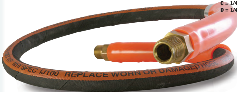
A = 1/4" I.D. Polyurethane B = 3/8" I.D. Polyurethane C = 1/4" & 3/8" I.D. Rubber D = 1/4" I.D. Non-Conductive

No. 9754 – Hose assembly consisting of 9756 (6' hose), 1/4" I.D. rubber with 9798 hose half coupler and 9800 dust cap assembled.